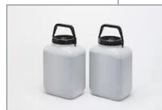
Aluminum grain / Crystal Ball